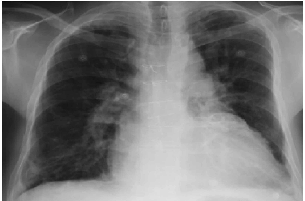
FIGURE 2: Chest X-Ray showing no acute abnormalities

The patient was admitted to the intensive care unit for severe rhabdomyolysis with acute renal failure and massive electrolyte imbalance. He was treated aggressively with intravenous (IV) isotonic normal saline at 200 ml/hour; hypocalcemia was supplemented with IV calcium gluconate, and hyperkalemia was treated with oral sodium polystyrene sulfonate, IV calcium gluconate, insulin, and dextrose along with albuterol nebulization. He was also started on four-hourly beta-agonist nebulization along with IV steroids for his shortness of breath. Despite aggressive hydration and intense medical management, his serum potassium, and creatine kinase (CK) level remained elevated, and he was anuric throughout. Urgent hemodialysis (HD) was initiated for refractory hyperkalemia. After receiving HD for three consecutive days, his electrolyte imbalance improved while his CK started trending down. His clinical condition improved, and he was subsequently transferred to the floor. His CK level trend (IU/L) until discharge was as follows: