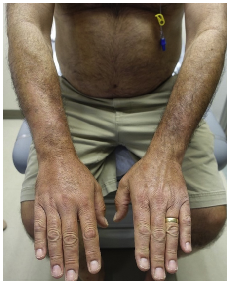
Fig 1. Clinical image of patient's arms. Area of woody, indurated edema with linear demarcation, overlying hair loss, and sclerosis. No sclerodactyly or edema of the fingers.

From Harvard Medical School a ; the Department of Dermatology, Yale School of Medicine b ; the Departments of Pathology c and Dermatology, d Brigham and Women's Hospital; and the Center for Cutaneous Oncology, Department of Dermatology, Dana-Farber/Brigham and Women's Cancer Center. e