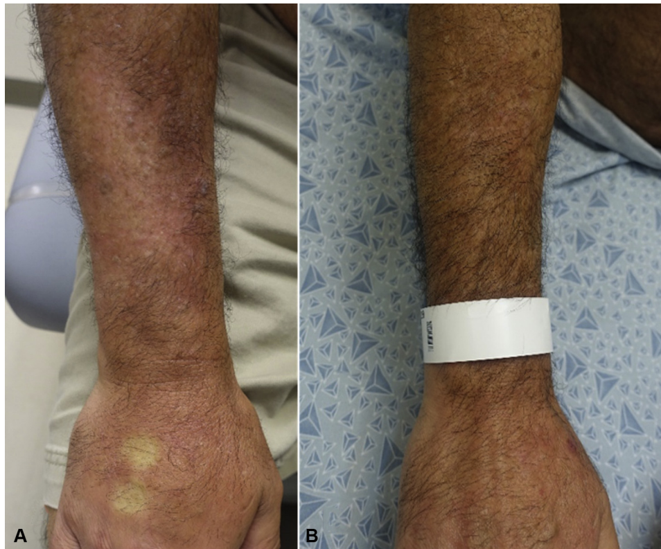
Fig 4. A , Clinical image of patient's right arm at presentation. Area of woody, indurated edema with linear demarcation on the proximal forearm, overlying hair loss, and sclerosis. B , Clinical image of patient's right arm after topical steroids under occlusion with ROM exercises, showing resolution of edema and hair regrowth after 1.5 years.

MRI. Our study supports the use of additional diagnostic tools for EF including MRI and full-thickness skin-to-fascia biopsy. We also performed workup for systemic involvement including PFTs.