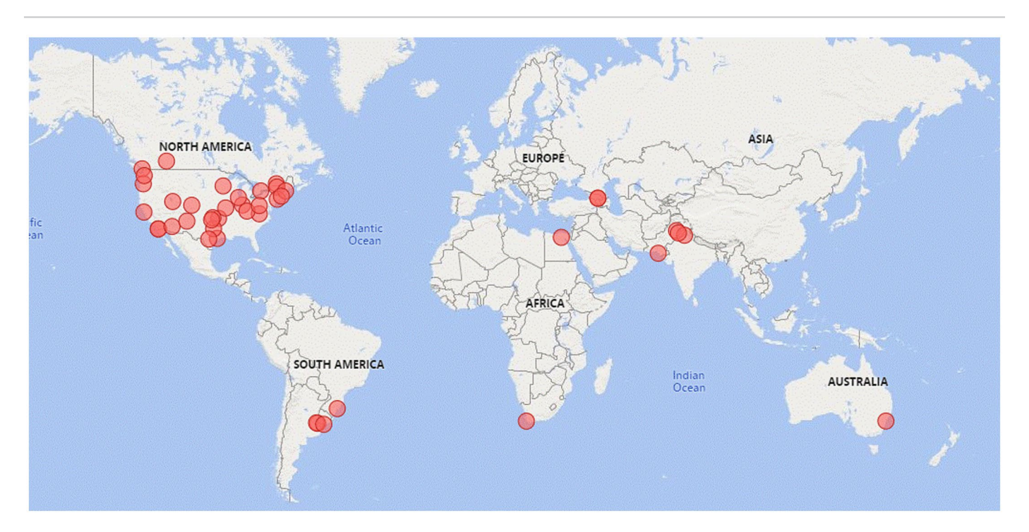
FIG 2 HCV ECHO programs around the world.