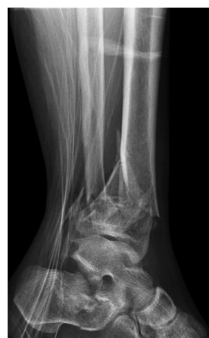
Fig. 1: Injury lateral radiograph of the right ankle