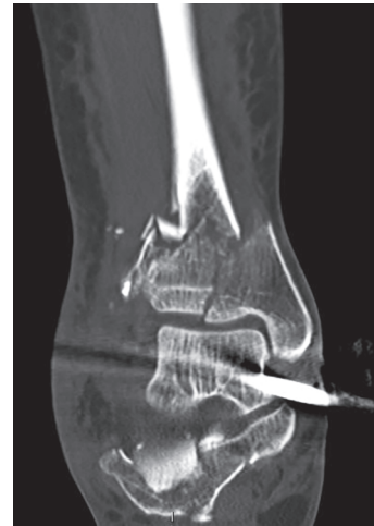
Fig. 3: Selected computed tomography coronal plane reconstruction image after spanning external fixator application