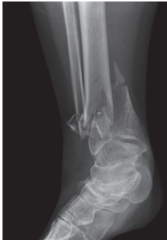
Fig. 2: Injury anterior-posterior radiograph of the right ankle