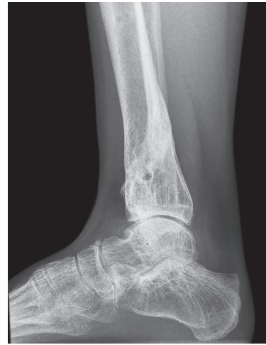
Fig. 7: Lateral radiograph of the right ankle during last follow-up