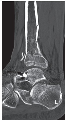
Fig. 4: Selected computed tomography sagittal plane reconstruction image after spanning external fixator application