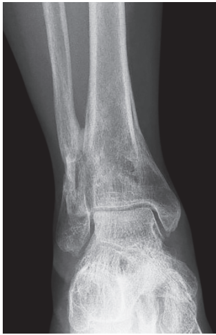
Fig. 6: Anterior-posterior radiograph of the right ankle during last follow-up