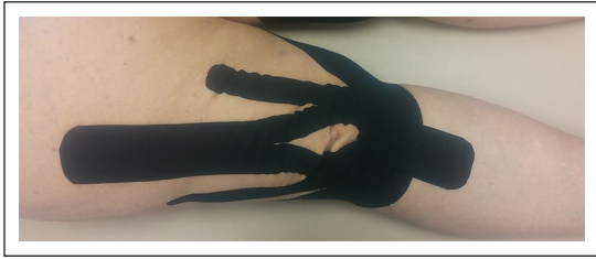
Figure 1. The Kinesio Taping® application.