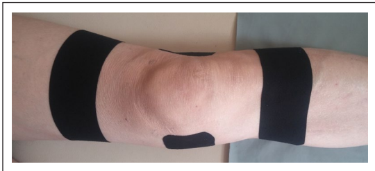
Figure 2. The non-specific taping application.

knee surface were applied with 0% tension. The detailed description of the intervention and the rationales for our choice of such control technique are provided in Appendix 2. The view of the completed non-specific taping application is presented in Figure 2.