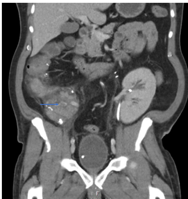
Figure 1 Computed tomography image of partial thrombosis in head of the pancreas (arrow).

of the graft. In one case partial thrombosis had progressed to complete venous thrombosis at the 3-month follow-up CT scan. This patient was insulin independent and kept on anticoagulation. In 11/17 after transplantectomy, patients were relisted on the waiting list: two for islet transplantation and nine for PAK transplantation.