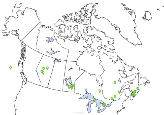
Figure 1. Geographic Distribution of Workshop Participants.

Participants recognized that true partnership does not refer to superficial consensus; it should focus on engagement and respect diverse expertise and perspectives. For example, when designing a research study, it is important to work with health system decision-makers to clarify what outcomes are most important to the group and how they plan to use the findings. Further, participants noted that not all research must be “partnership” research. Facilitators stressed that in some cases, it may only be that the researcher is interested in site access. They noted that health system decision-makers may be supportive of student learning and research in general and will likely try to accommodate requests if appropriate. By being honest and transparent, researchers can aim to align their requests with the workload of health system decision-makers. However, participants stressed that it can be challenging to manage the tension between valuing honesty and transparency, and working with organizational stakeholders who wish to amend research projects to address local needs.