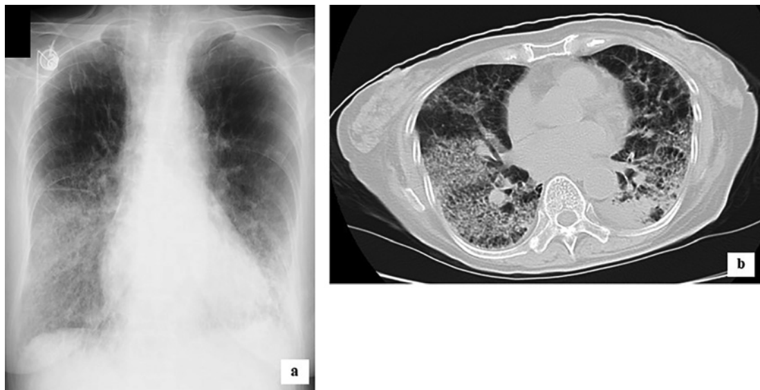
Fig. 1. Chest X-ray ( a ) and CT scan ( b ) of the patient at the onset of FIIP. a Reticular shadows with ground-glass opacities could be observed mainly in the middle and lower zones of both lungs. b Diffuse ground-glass infiltration with honeycomb-like shadow could be observed in both lungs.