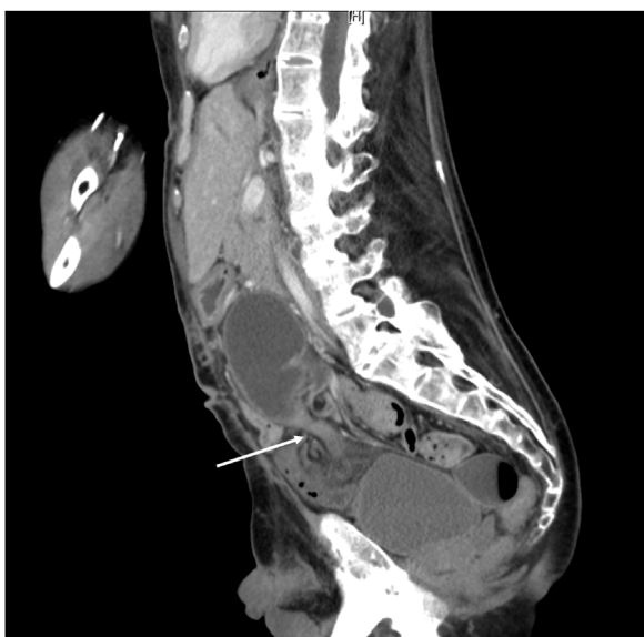
Fig. 3. Sagittal section of abdominal CT image prior to the second surgery showed small bowel stenosis and no ossification in the previous surgical scar.

tive CT showed no ossification in the previous surgical scar (Fig. 3). The surgical position and skin incision were the same as before. No ossification of the wound was observed, and we were able to open it without a problem. A cord formed by an adhesion between