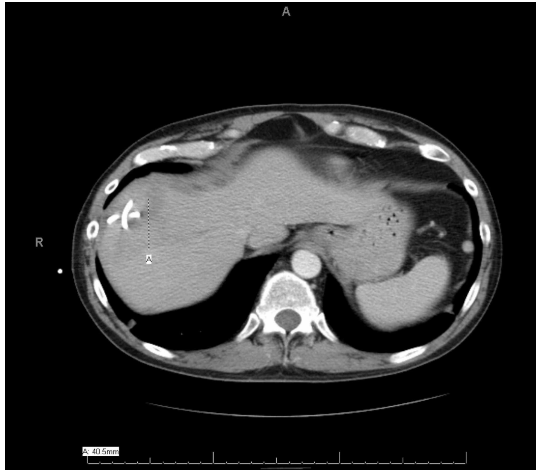
FIGURE 3: Repeat CT scan of abdomen and pelvis

the superior aspect of the liver suggestive of thrombosed superior right hepatic vein branch. No anticoagulation was started for treatment of the hepatic vein thrombus, as it was likely a pylephlebitis. Due to recurrent diverticulitis, three months after his hospitalization, he had sigmoidectomy with diverting loop ileostomy, which was eventually successfully reversed. Histopathological reports from the sigmoid resection during ileostomy and the reversal surgery did not show any evidence of malignancy.