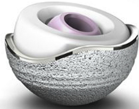
Figure 1. ADM cup (Stryker, Mahwah, NJ).

A total of 221 DM hips were implanted during the study period between the 4 institutions. Two hundred fifty fixed-bearing hips were also implanted among the institutions. An ADM cup was used in 184 of the 221 total hips. The remaining hips used a modular DM cup during the study period. Modular DM cups are used instead of