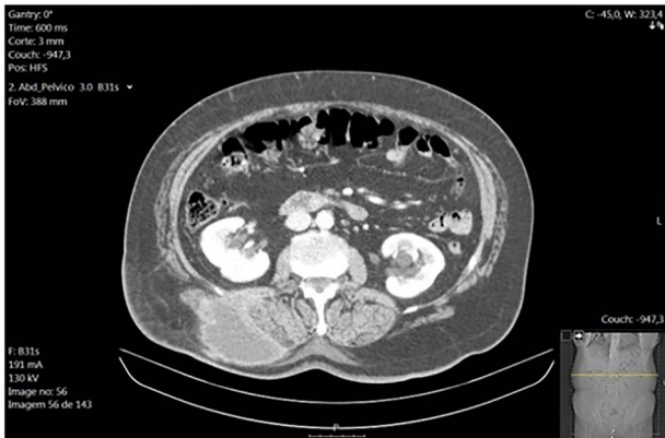
Figure 1: Right lumbar subcutaneous abscess (CT scan).