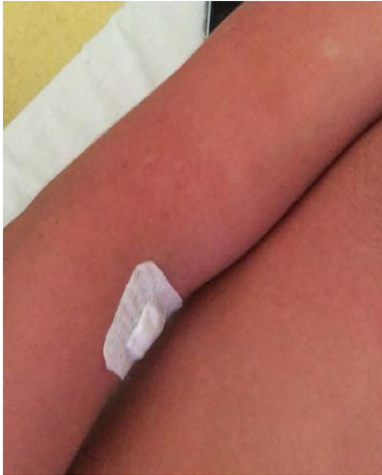
Fig 2. Photograph during hospitalization: diffuse exanthema with rounded island of sparing (“white island in a sea of red”).

https://doi.org/10.1371/journal.pntd.0008476.g002