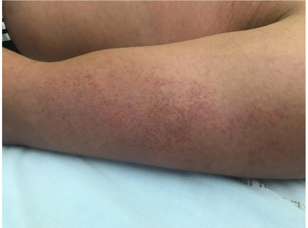
Fig 1. Photograph at hospital admission: roseoliform maculopapular exanthema with healthy skin intervals on left arm.

https://doi.org/10.1371/journal.pntd.0008476.g001