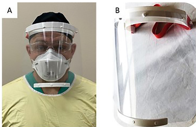
Fig 3. Depiction of the 3D printed face shield. (A) coverage and design, including use of goggles and a standard N95 mask underneath. Note the coverage that extends below the chin; and (B) completed face shield.

creality3dofficial.com/ ) or the Creality Ender 5 Series that was used to produce face shields in-house for TAMC personnel.