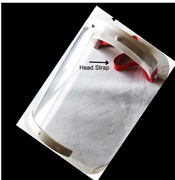
Fig 1. The terminology of the face shield components. Items referenced in the assembly direction refer to the items in Table 1.

Once the .stl file was obtained, it was loaded onto a computer capable of running the slicer software. The slicer software takes the 3D virtual model and determines the process required for the printer to produce the object layer by layer. The slicer printer software can