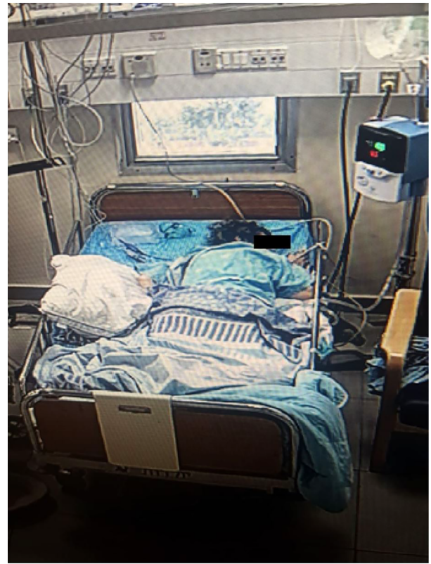
Figure 1 Awake prone position of a COVID-19 patient.

A 40-year-old male patient with no significant, past medical history was admitted to our department with moderate COVID-19 infection. The vital signs on admission were as follows: fever 38.0°C, blood pressure of 122/77 mmHg and heart rate of 85 b.p.m. The oxygen saturation was 88% in room air and increased up to 92% with oxygenation (4 LPM via nasal cannula). On physical examination, he appeared lethargic and was tachypnoeic (respiratory rate of 30 b.p.m.). His chest X-ray demonstrated mild bilateral peripheral consolidations. The ECG showed normal sinus rhythm (85 b.p.m.). The venous blood gas equation on admission showed pH of 7.401, \text{Pco}_2 of