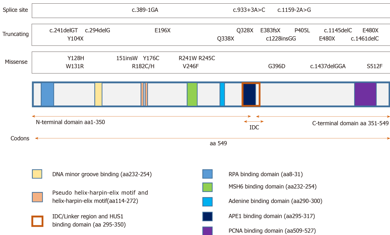
Figure 1 MUTYH functional domains and its binding partners (see UniProtKB - E5KP25). RPA: Replication protein A; MSH6: MutS 6 homolog; APE1: AP endonuclease 1; PCNA: Proliferating cell nuclear antigen; HUS1: Checkpoint clamp component. APE1, PCNA and well-known representative typical mutations of MUTYH (see all variants in ClinVar database); the mutation nomenclature is based on MUTYH longest transcript.

transcription factor EGR1 is an important mediator and regulator of synaptic plasticity and neuronal activity in both physiological and pathological conditions [57] .