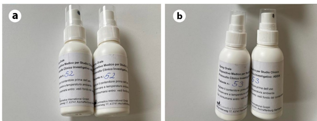
Figure 2. Spray bottles identical for the aldiamed ® spray (AS) and placebo spray (PS) groups (a,b).

The products were packaged anonymously and characterized by a progressive number (from 1 to 60). Patients were randomly divided into two groups, the AS group (test) and the PS group (control), as indicated by the randomization chart. The randomization was obtained using computer generated random numbers, centralized with sequentially sealed opaque envelopes provided by the study advisor as previously performed [24]. The envelope was opened only after the study was finished to reveal the allocation of the patients. Three spray bottles were provided to each patient containing an identification number. A double label was attached to each spray bottle and one of these was attached to the patient's medical record. The randomization list was known only to an officer not participating in the trial or evaluating the data. Both the patient and scientific experts were "blind" for what concerns the group they were assigned to. In addition, the AS and PS packages were identical in appearance (Figure 2).