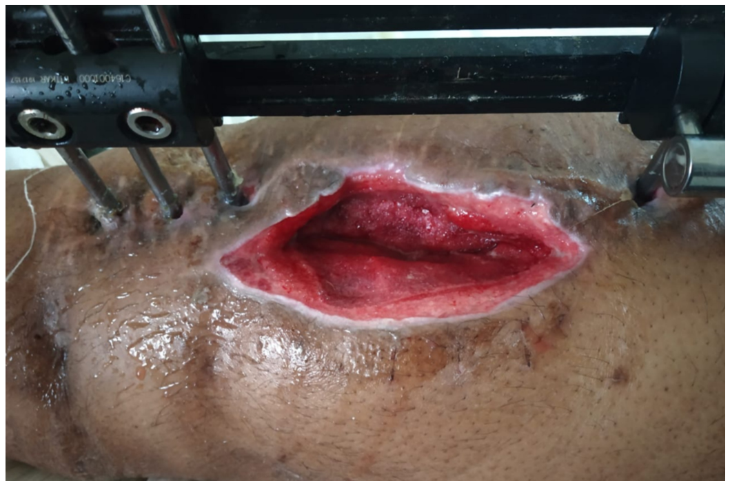
FIGURE 3: Clean wound after the use of negative-pressure wound therapy.