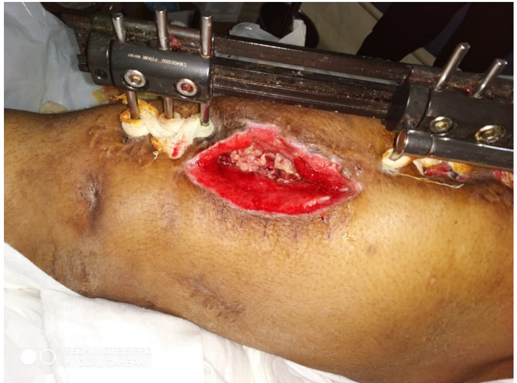
FIGURE 2: Wound with necrotic tissue (white tissue).