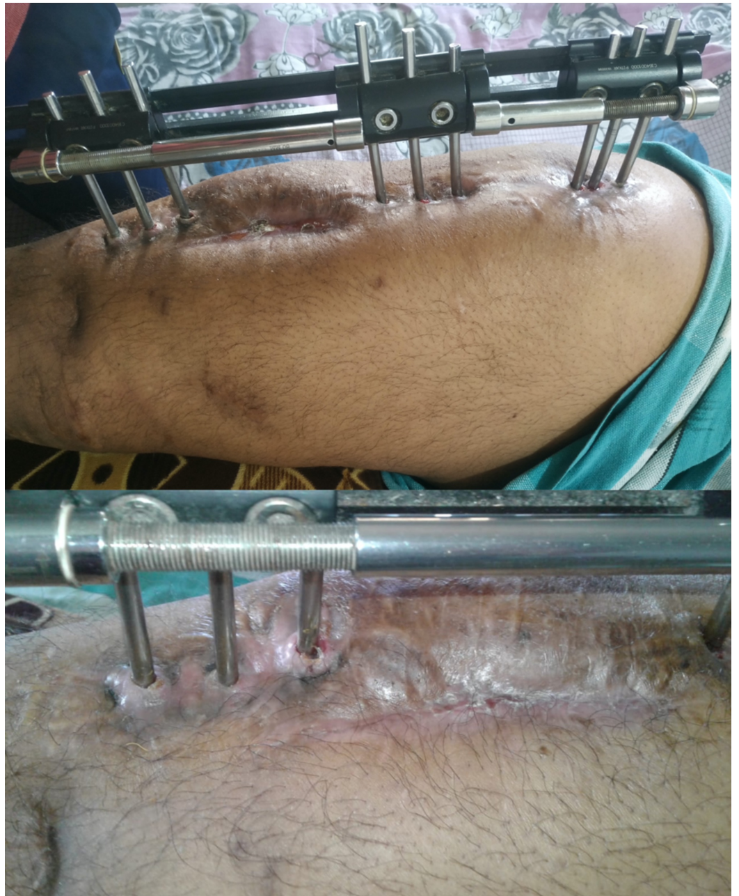
FIGURE 4: Healed wound.