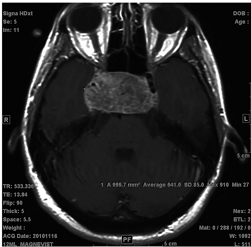
FIG 1. Example of an ROI selection. The largest possible elliptic ROI was drawn within the boundaries of the tumor or brain stem on axial images for average signal intensity measurements.

stem without incorporating adjacent structures (Fig 1). All ROI signal measurements were performed by a board-certified neuro-radiologist with 3 years of experience, blinded to clinical information. Subsequently, measurements in each patient were averaged to obtain the mean tumor precontrast T1, postcontrast T1, and T2 signal ( TS_{pre} , TS_{post} , and TS_{T2} , respectively) and mean brain stem precontrast T1, postcontrast T1, and T2 signal ( BSS_{pre} , BSS_{post} , and BSS_{T2} , respectively). The ratios of tumor signal to brain stem signal were then calculated for T1 precontrast ( R_{pre} = TS_{pre}/BSS_{pre} ), T1 postcontrast ( R_{post} = TS_{post}/BSS_{post} ), and T2 ( R_{T2} = TS_{T2}/BSS_{T2} ) imaging.