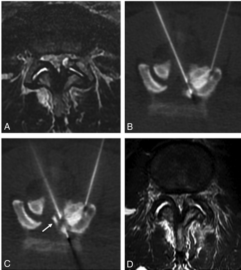
FIG 1. Successful CT-guided cyst puncture, aspiration, and fenestration. A , Axial T2-weighted MR image demonstrates bilateral L4–5 facet synovitis and a thin-rimmed T2-hyperintense cyst arising from the left L4–5 facet joint. B , Intraprocedural CT image shows contrast opacification of the cyst via injection into a 22-ga spinal needle placed within the left L4–5 facet joint (step 1). A second 22-ga spinal needle has been advanced coaxially into the cyst via a translaminar approach (step 2). C , CT image obtained after cyst aspiration and repeat fenestration demonstrates successful cyst perforation with leakage of contrast into the epidural space (arrow, step 3). D , Follow-up MR imaging shows resolution of the treated cyst.

ary objective, we sought to determine whether the patient’s presenting symptoms, LFSC imaging characteristics, or injection technique could be used to predict response.