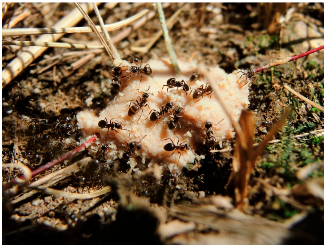
Figure 1. Workers of Lasius niger attracted to tuna bait.

probably constituted nurses. Workers were preserved in 70% ethanol until being measured. Species identification followed Czechowski et al. [25].