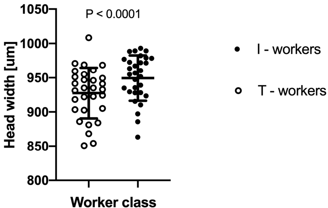
Figure 2. The difference in mean head width between Lasius niger foraging workers attracted to tuna baits (T-workers) and workers collected directly from the nest (I-workers). Each dot indicates an average head width within a given colony. Whiskers denote standard deviations (SD).