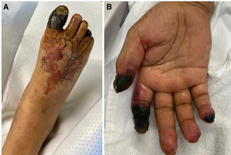
Fig. 1. Acral gangrene in late-stage COVID-19 patients. A, Gangrene of the right foot involving the hallux and fourth toe with retiform purpura on the dorsal midfoot. B, Gangrene of the right hand involving the thumb, index, and small fingers, with prominent retiform purpura on the ring finger (arrow).