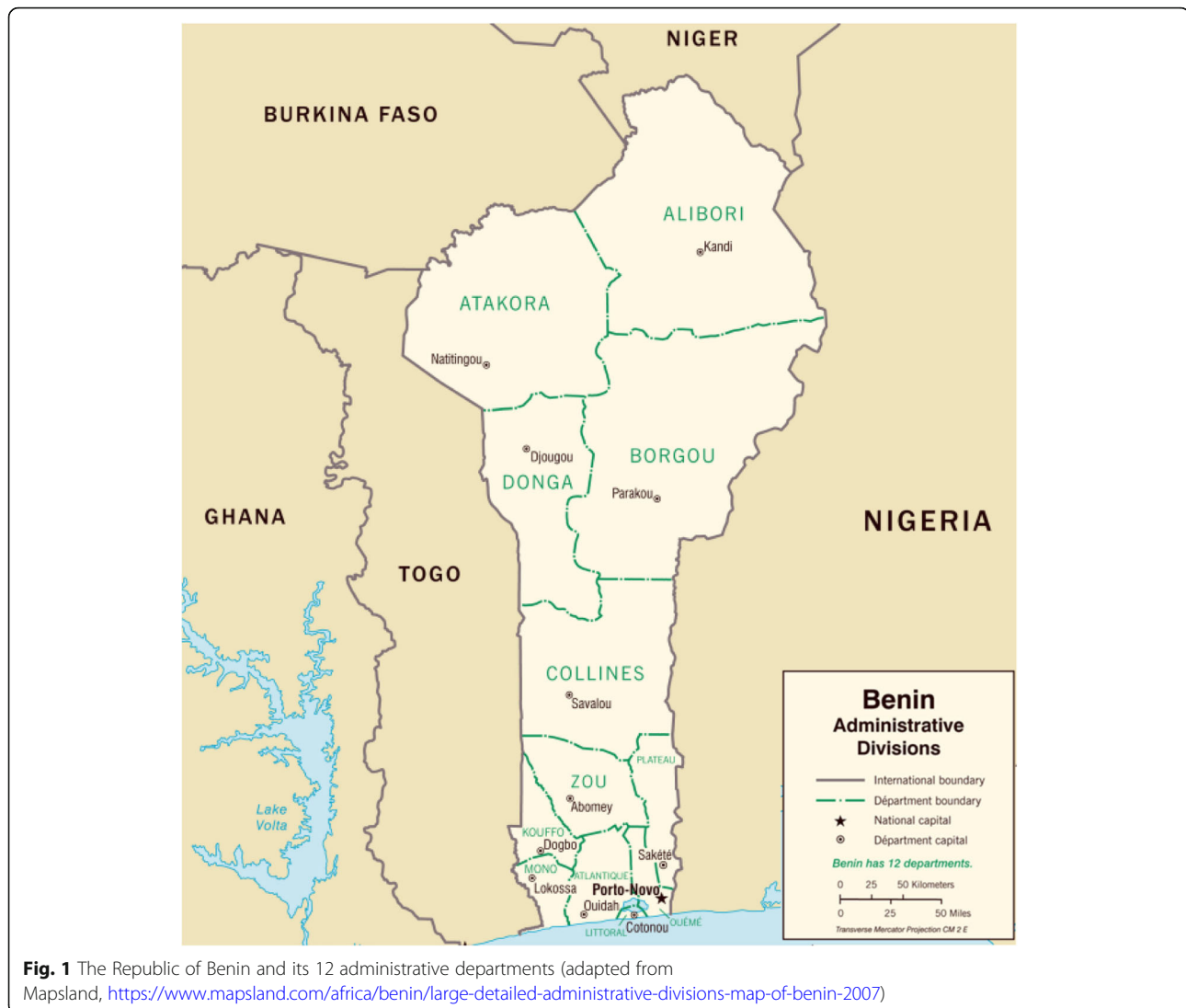
Fig. 1 The Republic of Benin and its 12 administrative departments

small, specialized health care facilities in these and smaller towns. Financial aid from international organisations provides resources to compensate for a shortage of medical personnel and medications. The process for decision-making about the introduction of vaccines into the EPI in Benin is summarised in Additional File 1.