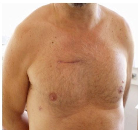
Figure 2 Result of a right anterior minithoracotomy approach.