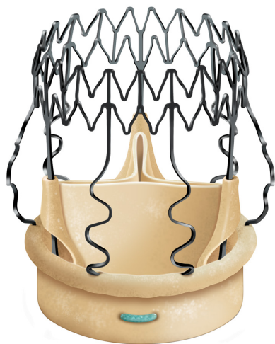
Figure 1 Perceval sutureless bioprosthesis.