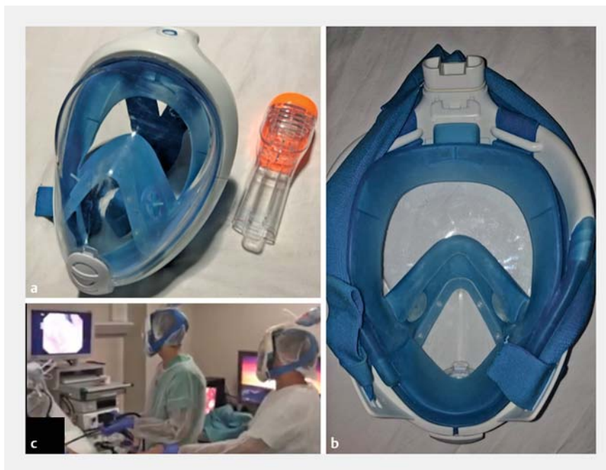
► Fig. 1 Aspect of the mask. a External aspect. b Internal aspect. c Aspect during endoscopy procedure.

In Tahiti’s endoscopy units, where FFP2 masks must be saved, we describe the possible use of the Easybreath mask as a protective device to replace FFP2 and FFP3 masks, goggles, and face shields. Pending 3D printing production of filters adaptable to the mask proposed by small Italian companies (Isinnova, Val Trompia), we used a surgical mask at the top of the snorkel to filter the air (► Video 1). This snorkeling mask has the advantage of being washable, disinfected, and reusable. This single unit provides full-face protection for endoscopy staff and appears to effectively safeguard the eyes, mouth, and nose from contact with the virus.