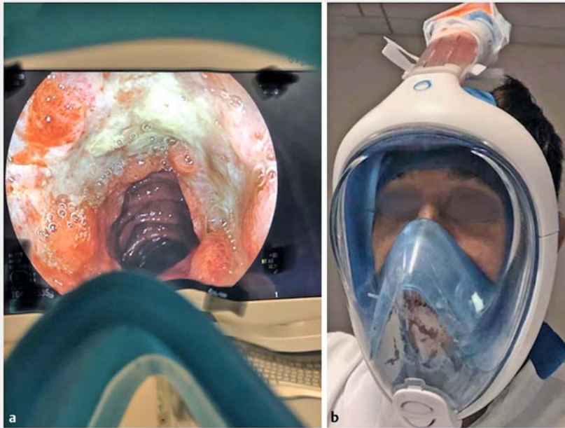
► Fig. 2 Easybreath mask. a Visibility of the endoscopy screen through the mask. b View of the endoscopist with the mask with a filter added on the snorkel.

In our experience, the endoscopic examination quality was not altered by reduced visibility (► Fig. 2a ). This product is particularly efficient at preventing fogging (► Fig. 2b ).