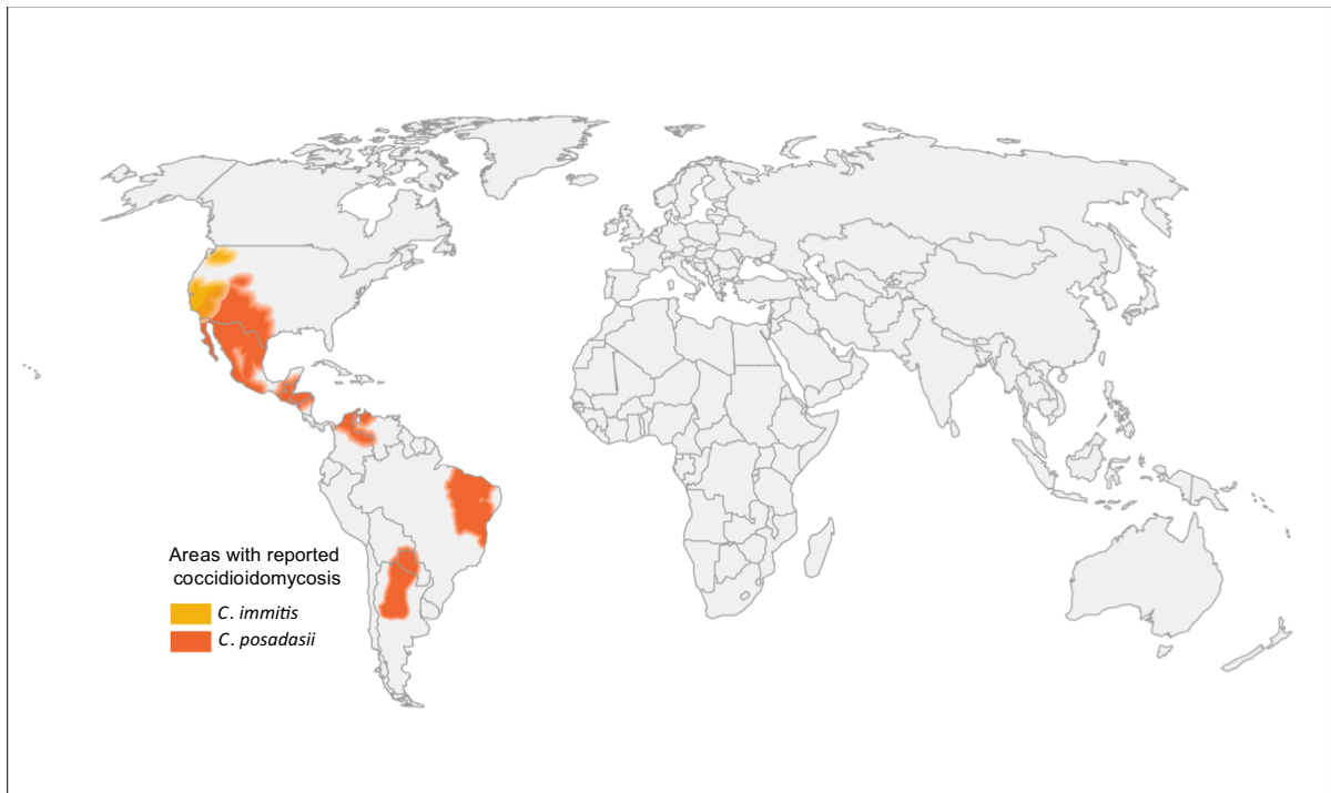
Fig. 2 World map estimating regions with coccidioidomycosis based on literature review

Haryana, Punjab, and Uttar Pradesh; as in many other settings, histoplasmosis is felt to be underdiagnosed in this country [63–65]. Histoplasmin sensitivities in Kolkata and Delhi range from 4.7–12.3% [61]. Histoplasmin sensitivity in Bangladesh was found to be 17.9% with 16 reported cases of histoplasmosis in the medical literature from 1982 to 2013 [66, 67]. One study found histoplasmin positivity in China of 9.0% overall with higher values in Hunan and Jiangsu provinces [68]. A review of 300 cases of histoplasmosis in China from 1990–2011 (257 disseminated, 22% HIV infected) found that 75% of the cases were from regions along the Yangtze River in southeastern China, with all but 17 cases thought to be autochthonous [69]. Moreover, the use of bat guano as an herbal medicine may increase the risk of acquiring histoplasmosis in endemic areas [70]. In Japan, histoplasmin sensitivity is negligible (except in those exposed to imported soils) and local bat guano does not contain Histoplasma [61, 71]. The majority of cases of histoplasmosis in Southeast Asia have been reported from Thailand, where 1253 cases of disseminated histoplasmosis among HIV-infected persons were reported to the Ministry of Public Health from