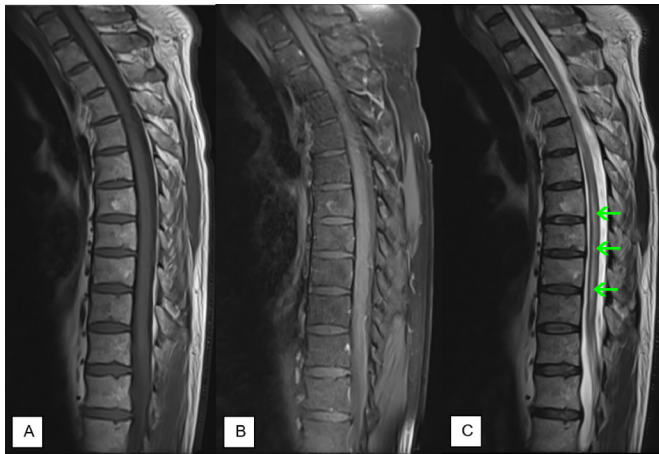
Figure 2 MRI of the patient's thoracic spine. (A) Sagittal T1 sequence of the thoracic spine. (B) Fat-saturated sagittal T1 sequence of the thoracic spine postintravenous gadolinium contrast. (C) Sagittal T2 sequence of the thoracic spine, demonstrating a long segment of T2 signal elevation centrally in the spinal cord from T7 to T10. No significant canal stenosis or paravertebral mass was observed.

reported in the context of acute COVID-19 infection. 5 In this instance, SARS-CoV-2 RNA was detected in CSF and MRI brain-demonstrated findings consistent with meningitis. 5 Wu et al 2 further hypothesise that SARS-CoV-2 may induce neuronal injury via hypoxic and immune-mediated pathways. SARS-CoV-2 binds strongly to ACE2 receptors that have been described in the heart, lungs, CNS and skeletal muscle. 1,2 Viral replication and thus increased ACE2 receptor activation in the CNS may trigger a systemic inflammatory response, resulting in increased permeability of the blood–brain barrier and immune-mediated inflammation of the CNS. 2 IL-6, a proinflammatory cytokine, has been thought to mediate this response. 6–8 Elevated IL-6 level leads to increased acute phase protein production such as CRP and fibrinogen. 6 IL-6 has been recently highlighted as a potential predictor of COVID-19 infection severity, progression and mortality. 6–8 Elevated ferritin levels have also been linked to more severe infection and poorer outcomes. 7 Unfortunately, IL-6 and ferritin levels were not performed for this patient on admission. Serum ferritin level remained elevated 28 days from symptom onset, but IL-6 level was normal. It is important to note that this was also 4 days post-steroid administration and therefore could potentially reflect amelioration.