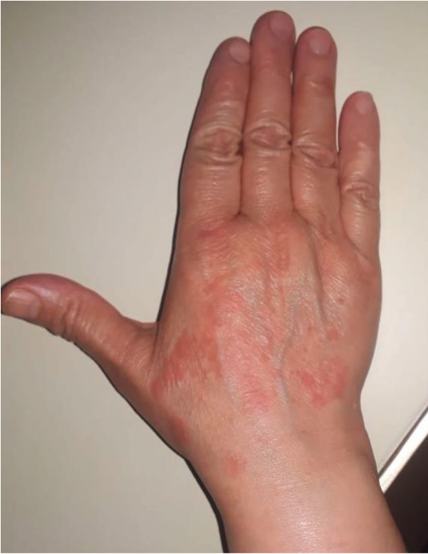
FIGURE 3: Contact dermatitis caused by chemical materials in latex gloves (picture is from our department; written consent was provided by the participant).

3.3. Aggravation of Previous Skin Diseases during COVID-19. Exacerbations of preexisting dermatoses such as acne, rosacea, atopic dermatitis, and neurodermatitis have been observed [3, 7]. This can be explained by the prolonged wearing of masks during the epidemic. The occlusion generated by protective hats may provoke pruritus and folliculitis or exacerbate seborrheic dermatitis [11], and the frequent use of disinfectant and soap can impair the hydrolipid mantle of the skin and increase the risk of contact dermatitis [7]. The current stress generated by the global situation and confinement can also exacerbate dermatoses [12].