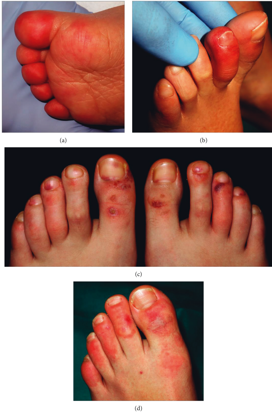
FIGURE 2: Details of the clinical spectrum (reused from Roca-Ginés et al. JAMA Dermatology 2020 [30]; reference under the terms of the CC-BY license, which permits unrestricted use, distribution, and reproduction in any medium). (a) Acral erythema pattern. (b) Dactylitis pattern. (c) Maculopapular purpuric pattern. (d) Mixed patterns.

contact and pressure urticaria or contact dermatitis and pigmentation of the nasal bridge [3, 11]. In a survey study [12], Lan et al. found that 526 participants among healthcare professionals mentioned that they had damaged skin. The nasal bridge was the most affected area and then hands, cheek, and forehead. Dryness and desquamation were the most common symptoms, and these damages depended on the hours of work, especially for gloves wearing.