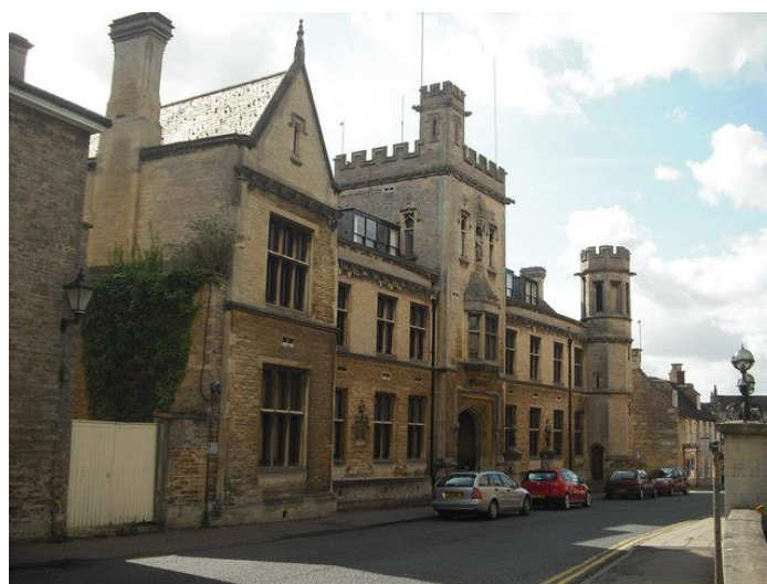
Figure 2. Oundle School.