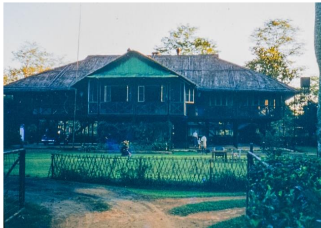
Figure 4. Principal Medical Officer's House, near the Dibru River, where the Wilson family lived.

The family lived in a compound on the edge of Doom Dooma town in a bungalow on stilts (Figure 4), typical of the area, allowing the breeze to blow beneath keeping them cool and to protect them from flooding and wild animals.