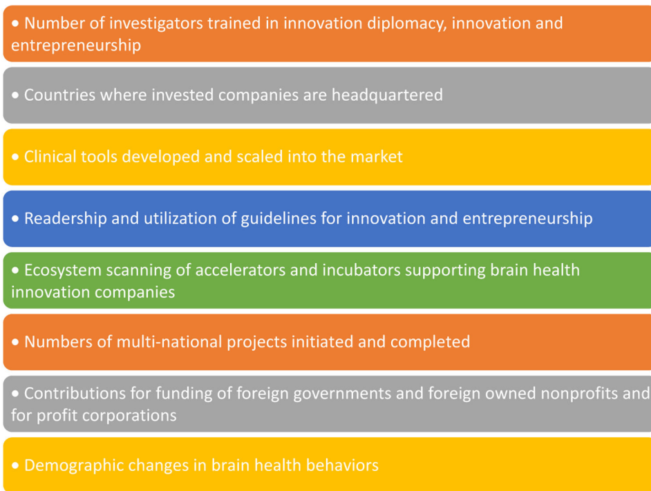
Figure 2. Potential Measurable Outcomes of Brain health INnovation Diplomacy-Related Activities.