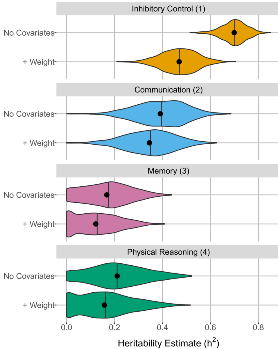
Fig. 2. Distribution of narrow-sense heritability estimates for each factor, both without covariates (“No Covariates”) and controlling for breed-average weight as a fixed effect (“+ Weight”). Each model was run with resampled cognitive data across 1000 iterations, using 15 individuals per breed at each iteration. The black points represent the mean and the vertical black lines represent the median heritability estimate over these 1000 runs. Scores on the inhibitory control factor have the highest heritability, followed by scores on the communication factor. Scores on the memory and physical reasoning factors had lower heritability estimates. Controlling for breed-average weight reduced the heritability estimates across all factors, but the effect was minimal except for the inhibitory control factor