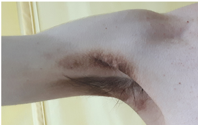
Figure 1 The extent of acanthosis nigricans in the patient on admission.

Physical examination revealed malnutrition. Height was 180 cm and weight 53.3 kg (BMI 16.4 kg/m 2 ). There was widespread acanthosis nigricans in the axillae, antecubital fossae, groins, and on the thumbs (Fig. 1). Sclerodactyly, psoriatic lesions, enlarged parotid glands, palpable cervical and axillary lymph nodes, and tachycardia were also noted. Dual energy X-ray absorptiometry revealed a paucity of subcutaneous and visceral fat and decreased lean body mass (Fig. 2). Table 1 shows laboratory findings on admission. Full blood count revealed anaemia, leucopaenia with lymphopaenia, and thrombocytopenia. Blood glucose concentration on admission was 20.1 mmol/L with glycated haemoglobin (HbA1c) 12.4% (112 mmol/mol) and associated glycosuria. From day 17 of observation, the patient developed asymptomatic morning fasting hypoglycaemia, more frequently observed in the further