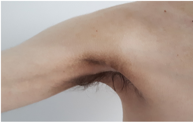
Figure 5 The amelioration of acanthosis nigricans after 6 months of treatment with glucocorticosteroids, hydroxychloroquine and metformin.

weight gain increased further (BMI 19.7 kg/m 2 ), with the disappearance of acanthosis nigricans, significant improvement of arthritis and reduction of psoriatic lesions. Fasting glucose concentration was 4.3 mmol/L.