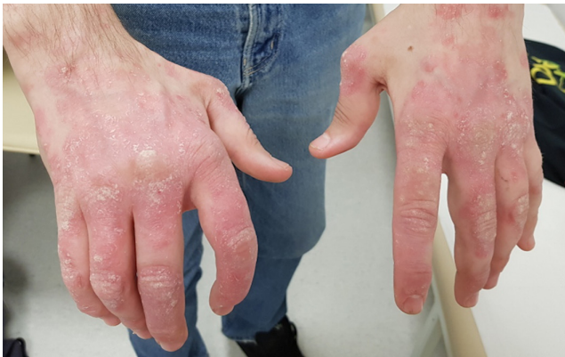
Figure 6 The extent of psoriatic lesions occurring during follow-up.

Type B insulin resistance is rare. The largest longitudinal cohort of 24 patients has been reported by researchers from the United States National Institutes of Health (NIH) (1). It occurs mainly in the fourth to sixth decade of life, usually against a background of a rheumatological illness, most commonly connective tissue disease, lupus erythematosus, or as a paraneoplastic manifestation (1, 2, 7). We report a younger male Caucasian patient with typical symptoms of TBIR in association with mixed connective tissue disease and psoriasis. We assessed insulin sensitivity by hyperinsulinaemic euglycaemic clamp to confirm the severity of insulin resistance.