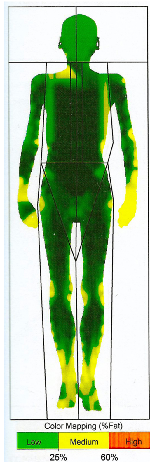
Figure 2 Distribution of adipose tissue obtained by dual energy X-ray absorptiometry.