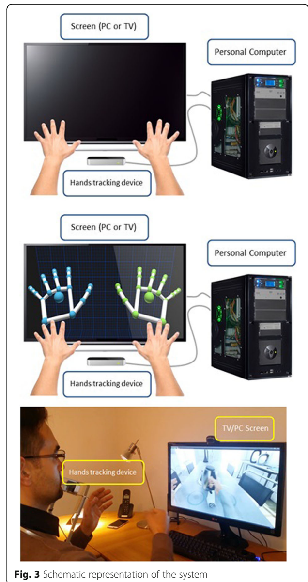
Fig. 3 Schematic representation of the system

Conventional therapy will focus on task-related upper-limb treatments while in sitting denoting the standard care for PwMS [2]. Several manual techniques, therapy tools and objects of ADL will be allowed during treatment. Use of additional electrical or mechanical therapy devices (i.e., support arm systems, splints) will be avoided. The interventions will be conducted on a one-on-one basis in the physiotherapy or occupational therapy department of each participating center. Training and therapy content