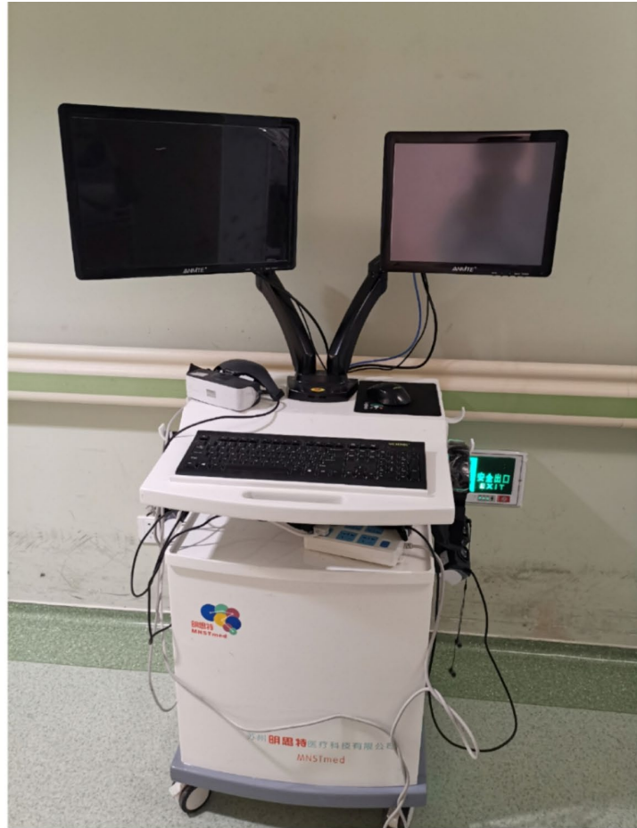
FIGURE 1 The Mirror Neuron System Training (MNST, V1.0, Suzhou MNST Medical Science and Technology Co., Ltd) machine and patient training status