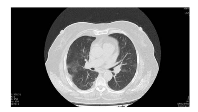
Fig. 3. Bilateral, multilobular ground-glass opacities.

In conclusion, the patient with Melkersson–Rosenthal syndrome presented to our emergency department with rare clinical findings of the classic triad. The patient was diagnosed with COVID-19 pneumonia after a series of procedures carried out based on the recent-onset malaise in her history. COVID-19 infection, which was not previously included in the etiology of the disease, can now be considered among the causes of recurrence of the syndrome. Moreover, further research on mast cells will positively contribute to the treatments of both diseases.