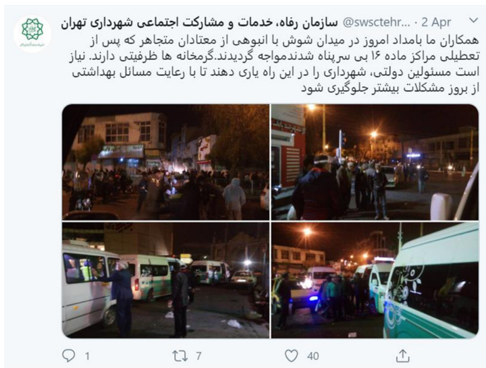
Fig. 1. Twitter screenshot of Tehran Municipality Welfare, Services & Social Participation Organization (@swsctehran) published images of people who use drugs violating physical distancing policies in Shoosh neighbourhood of South Tehran, April 2.

public health strategy (Ameli, 2020; Kokabisaghi, 2018; Murphy, Abdi, Harirchi, McKee, & Ahmadnezhad, 2020; Takian, Raofi, & Kazempour-Ardebili, 2020).