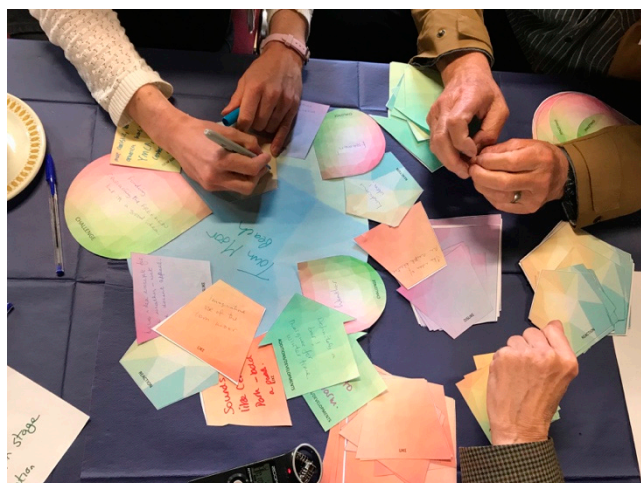
Figure 3. Participants generating an idea to develop a beach and water feature on an existing outdoor area of green space.

As described earlier, the workshop was designed to build on the findings from our interviews. An extensive list of ideas was generated through our ideation activities, which we combined and organised under themes and sub-themes. Table 4 summarises the themes and sub-themes identified in our analysis of the written workshop data. Participants commented that the workshop had been enjoyable and thought-provoking—an outcome that supports us in challenging ageist stereotypes of older people as unable or unwilling to engage in creative, disruptive or wild thinking.