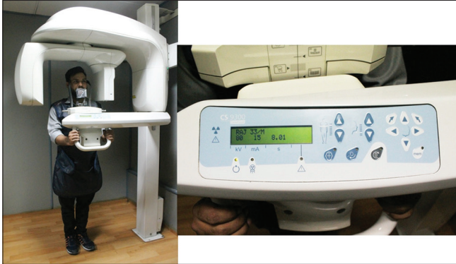
Figure 1: Cone-beam computed tomography machine (CS 9300 Care Stream) showing patient position

The overall mean age of the patients (forty males and forty females) was found to be 42.64 \pm 16.22 years, with males having slightly more age than females although the difference was insignificant. A pilot study was conducted on five patients to examine the interobserver