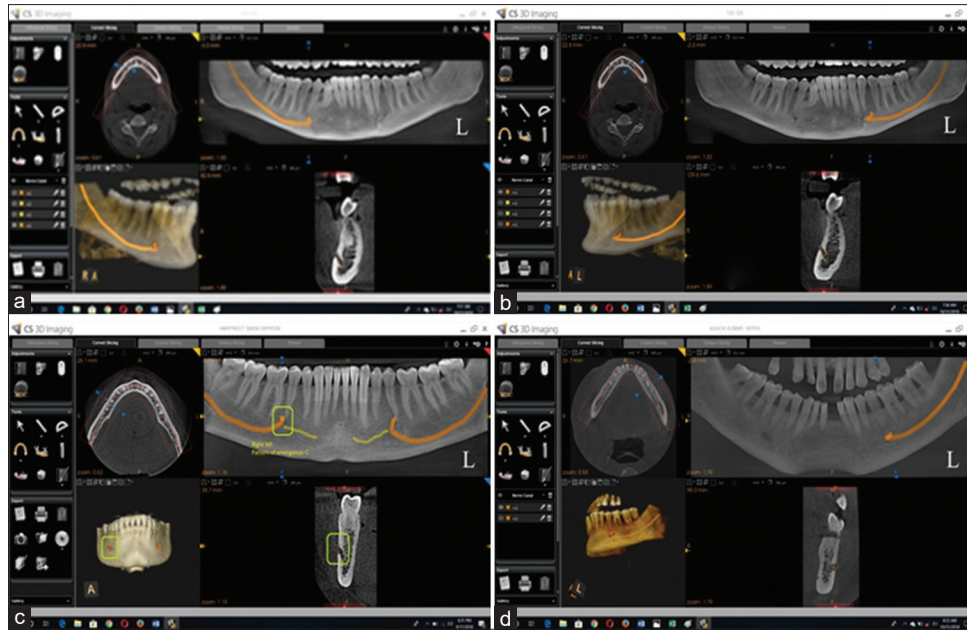
Figure 3: Cone-beam computed tomography scans showing emergence patterns of the mental canal and normal foramen opening (a) superiorly, (b) posterosuperiorly, (c) labially, and (d) posteriorly