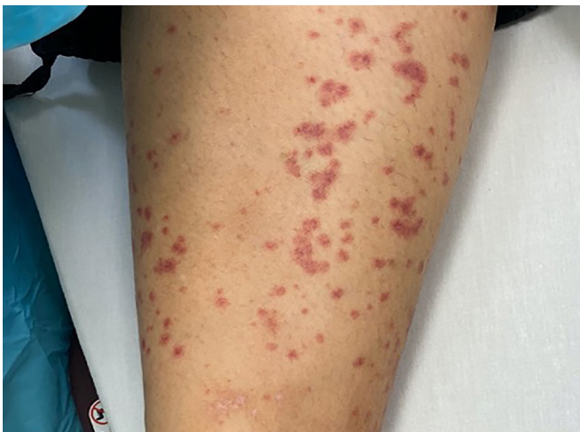
Image 1. Non-blanching purpuric rash on the bilateral lower extremities of a patient with COVID-19 with concurrent non-blanching maculopapular rash on the abdomen.

Early identification of COVID-19 cases based upon known clinical presentations is critical for appropriate patient care as well as public health outcomes.