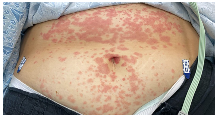
Image 2. Non-blanching maculopapular rash on the abdomen of a patient with COVID-19 with concurrent non-blanching purpuric rash on the bilateral lower extremities.