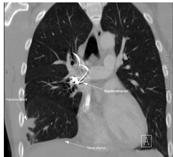
Image 2. Computed tomography imaging showing a migrated pelvic coil (mid-image arrow) in the right pulmonary artery with areas of pulmonary infarct in the right middle and lower lobes and a small right pleural effusion (left and lower arrows).

The patient was observed in the hospital overnight and went home the following day without anticoagulation or other