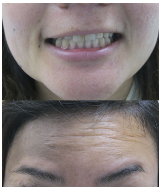
Figure 2. Motor weakness of the right forehead and corner of the mouth.

On the day of admission to our hospital, the administration of acetaminophen and the Japanese Kampo medicine Maoto was started. In Japan, Maoto is used for elderly pa-