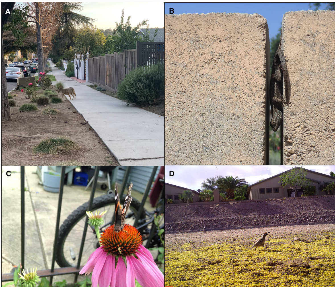
Fig. 2. Variation in urban wildlife and urban environments illustrated across the yards of urban ecologists. (A) Coyote ( Canis latrans ) on sidewalk, Los Angeles, California, USA (iNaturalist observation number: 38627446); (B) western fence lizard ( Sceloporus occidentalis ) in wall microhabitat, Claremont, California, USA; (C) red admiral butterfly ( Vanessa atalanta ) on a purple coneflower ( Echinacea purpurea ), Chicago, Illinois, USA; and (D) Gambel's quail ( Callipepla gambelii ), Phoenix, Arizona, USA.

more robustly evaluate ecological patterns (Pacifi et al. 2017). Further, establishing these studies now may be useful in anticipation of additional shutdowns during subsequent waves of the pandemic.