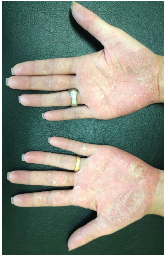
Figure 6 The pustular eruption affecting both palmar surfaces of the hands.