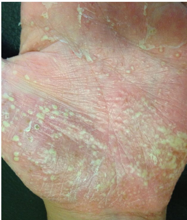
Figure 5 A closer look of Figure 4.

PSORS1 (the most powerful identified genetic risk factor for psoriasis vulgaris) has not been associated with PPP. 13 Genetic studies of TNF-238 and -308 promoter polymorphisms in PPP revealed no connection between polymorphisms and PPP. 23