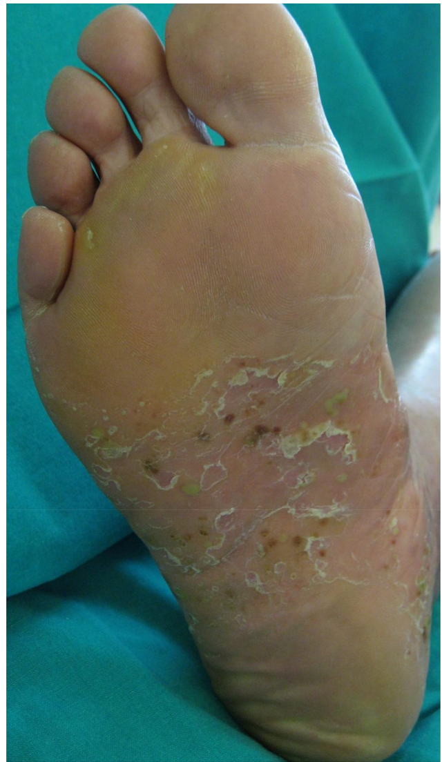
Figure 3 Pustular lesions in a erythematous and scaling plaque affecting the central zone of the plantar surface of the foot.

Studies carried out in patients with generalized pustular psoriasis have found a mutation in IL36RN, and this is considered the most important predisposing factor for generalized pustular psoriasis (GPP). 16 However, the IL36RN mutation was found only in a low proportion of patients with PPP, and no association was found between the IL36RN mutation and PPP. 17 More recently, Twelves et al 17 studied the genetic and clinical characteristics of different forms of pustular psoriasis. Loss of- function mutations in IL36RN were present in 5.1% of patients with PPP. Additionally, it was found that there was a statistically significant association between PPP and IL36RN mutations. Twelves et al 17 also suggested that mutations in IL36RN are related to early onset of the disease in all types of pustular psoriasis and that patients with PPP and age <40 years should do a screen for mutations in IL36RN. 18 Therefore, recent studies indicate the role of the mutation of the IL-36 receptor antagonist gene (IL-36RN) in the development of PPP but also in several forms of psoriasis, namely the plaque type, the pustular palmoplantar type and the generalized pustular type. 19 This finding infers that the interleukin-36 pathway may be implicated in the pathogenesis of this disease. 20 It has