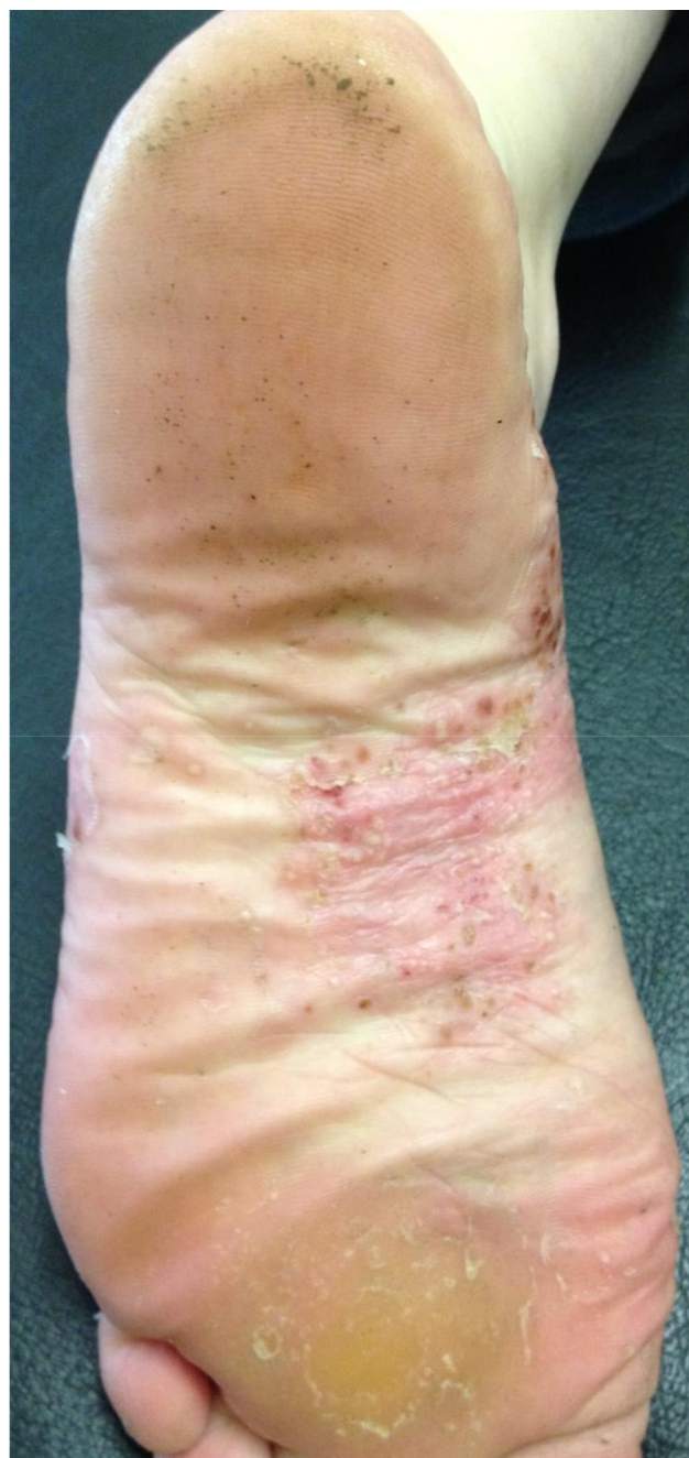
Figure 1 Scattered pustules on a erythematous base with desquamation on the medial zone of the plantar surface of the foot.

Regarding age at onset of disease, disease duration, family history of psoriasis, concomitant arthritis, and cardiovascular disease, no significant differences have been reported between PPP and PPPP in observational studies. 7 On the other hand, female sex, smoking, and autoimmune thyroid disease seem to be associated with PPP. 11,12 In fact, the association with smoking is strong, and it is thought that in individuals with PPP, nicotine is secreted into eccrine glands to promote inflammation and alter the local response to infection. 9 Recent studies have challenged the genetic