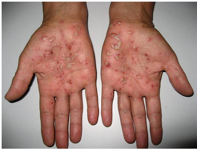
Figure 2 Pustules, sometimes coalescing, with erythematous halo, affecting mainly the palms.

be viewed as an entity independent of psoriasis, mainly due to genetic studies that have not shown an association with the psoriasis susceptibility gene 1 (PSORS 1). 13 Many genetic studies have revealed that PPP may have numerous mutations in the IL36RN, CARD14 and ASPIS3 genes. 14 Future clinical and genetic studies will be crucial to elucidate whether this diverse genetic profile can affect the response to therapy - i.e, biological. 15