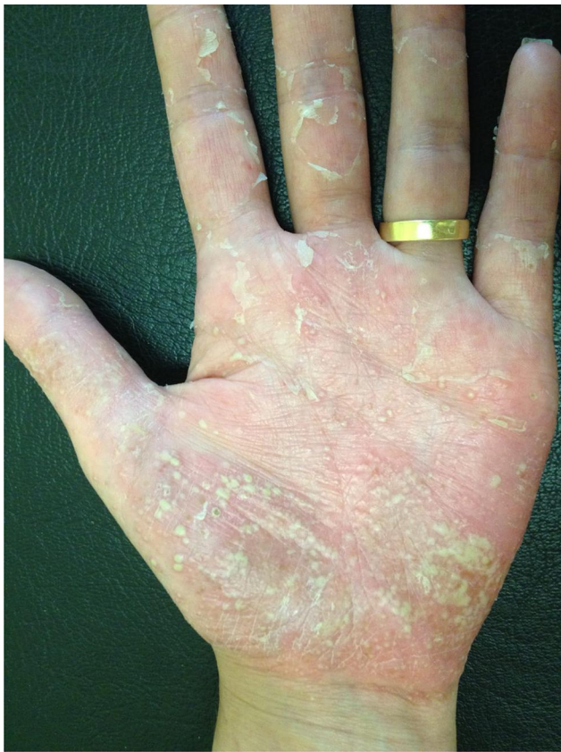
Figure 4 Erythema, multiple pustules and scaling in the palmar surface of the hand.