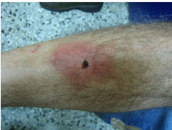
Figure 3. Male patient that suffered an intra-domiciliary bite, while he was trying to capture a bat. He sought medical attention; the bat species was identified as Desmodus rotundus . The bat was negative for RABV; however, the patient received post exposure prophylaxis.

During December 2006, 23 cases of jungle rabies were recorded in human patients from Peru where a variant of the bat rabies virus was identified in deceased patients (Gomez-Benavides et al., 2007); a study later reported a seroprevalence rate of 10.3% in bats from Peru (Salmon-Mulanovich et al., 2009). A similar investigation was conducted on hematophagous bats in Mexico, finding antibody prevalence rates of 37% (Salas-Rojas et al., 2004) (Figure 1).