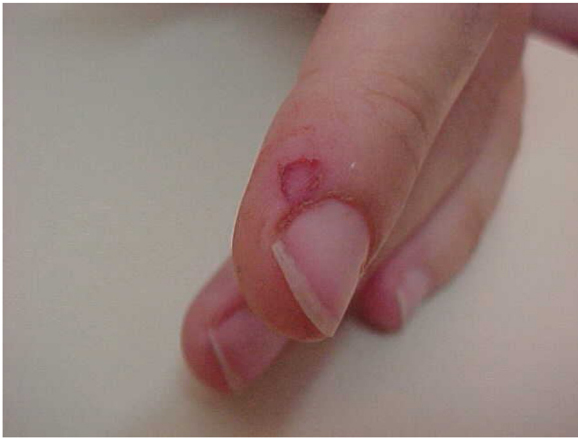
Figure 2. Biology researcher who suffered a Desmodus rotundus bite during a field work trapping bats in Venezuela. The bat resulted positive for RABV; however, the patient received prophylaxis post exposure and did not develop clinical disease.