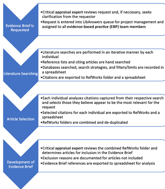
Figure 1 Flowchart of the process for the quality improvement (QI) project

Each person exported all retrieved citations from their final search strategies for each database and any citations discovered through hand searching into the individual's "search results" RefWorks folder and Microsoft Excel spreadsheet. A flowchart of the process for the QI project can be found in Figure 1.