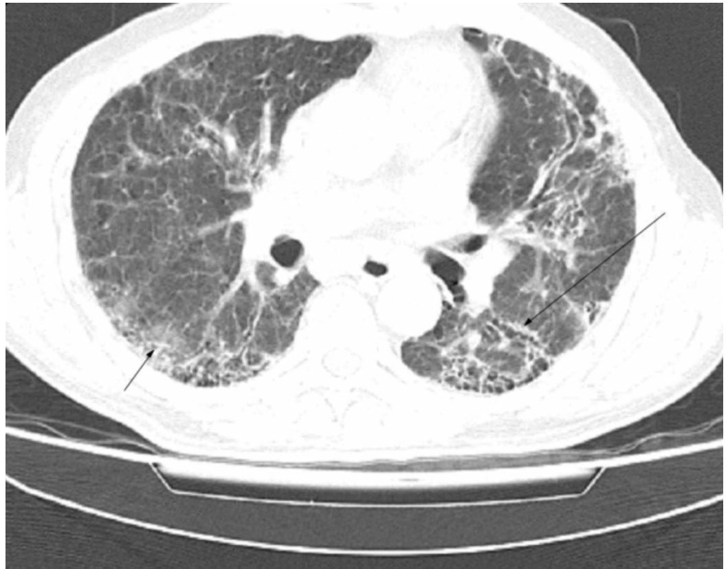
FIGURE 2: High-resolution computed tomography scan of a COVID-19 patient with preexisting idiopathic pulmonary fibrosis

When checked on admission to the Isolation Chamber, his temperature was 40 C, blood pressure was 70/40 mmHg, pulse was 130/min and regular, and respirations were 40/min. The patient was lethargic and confused. Physical examination revealed conjunctival pallor and an unremarkable jugular venous pulse, and no evidence of joint disease. Bilateral crackles were heard on lung auscultation. Cardiac auscultation revealed no murmurs or additional sounds. Pulse oximetry showed 90% SpO 2 on room air. His real-time RT-PCR assay of nasal and pharyngeal swab specimens for SARS-CoV-2 had come out positive. HRCT done at this time revealed new ground-glass opacities superimposed on pulmonary fibrosis (Figure 2). No cavitating lesion, soft tissue attenuation nodule(s), pleural effusion or hilar adenopathy was observed and there was no evidence of discrete chamber or main vessel enlargement. Treatment was initiated with cap hydroxychloroquine 400 mg × BD, IV azithromycin 400 mg × OD, IV solu cortef 100 mg × TDS, and heparin. He was also being treated with IV fluids and a norepinephrine infusion.