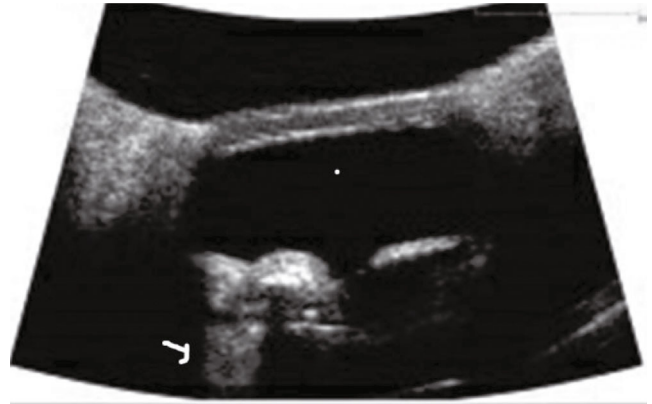
FIGURE 2: UBM image of the patient with hyperreflectivity in the ciliary body adjacent to the supraciliary space with a comet tail artifact (white arrow). It could be due to implant migration anteriorly and fibrous downgrowth.

sleeve-coated forceps. The sclerotomy was then closed with 5-0 mersilene sutures at the edges of the filament. Next, we placed the microelectrode array and perform transretinal and transchoroidal tacking of the array by placing the array on the surface of the macula holding from the manipulating knob with Eckhardt’s forceps. It was orientated 45 degrees correctly to the transverse plane of the macula with the left inferior corner at the edge of the optic nerve. At 4 o’clock, 19-gauge sclerotomy was fashioned with an MVR blade. Then, retinal tack was loaded in the tacker, and bimanually, tack was passed through retina and choroid and tacked onto the posterior sclera, while keeping the microarray plate in position. Then, the donor-processed scleral patch was fashioned and secured with 7-0 vicryl. Similar patch was used to cover the coil inferotemporally and secured with 7-0 vicryl. Finally, we closed all sclerotomies and peritomy with 8-0 nylon and 7-0 vicryl, respectively.