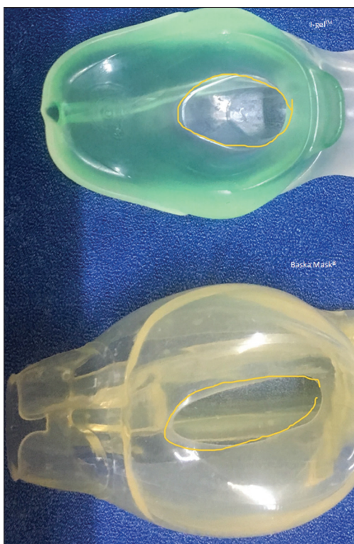
Figure 3: Comparison of ventilation apertures of Baska mask® (30 × 6 mm² for size 4) and I-Gel™ (16 × 7 mm² for size 4)