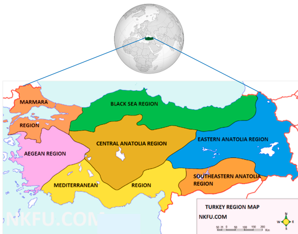
Fig. 1. Regional map of Turkey.

names, English common names, parts used, forms used, and references. The validation of the scientific names of the specified plant taxa was provided by the book Turkey Plant List (Vascular Plants) (Güner et al., 2012), the International Plant Names Index (IPNI: http://www.ipni.org ) and the Plant List ( http://www.theplantlist.org ). English common names of the taxa are placed in the table using the following databases or search engines: EPPO Global Database ( https://gd.eppo.int ), Plants Database ( http://garden.org/plants ), USDA PLANTS ( https://plants.sc.egov.usda.gov/java ), Encyclopedia of Life ( https://eol.org ), Lebanon Flora ( http://www.lebanon-flora.org ), Springer Link ( https://link.springer.com/article ), Flora of Israel Online ( http://flora.org.il ), Altervista Flora Italiana ( http://luirig.altervista.org/flora ), and Plants of the World online ( http://www.plantsoftheworldonline.org ). Taxa for which common English names could not be found have been noted as endemic to Turkey, or containing Irano-Turanian elements.