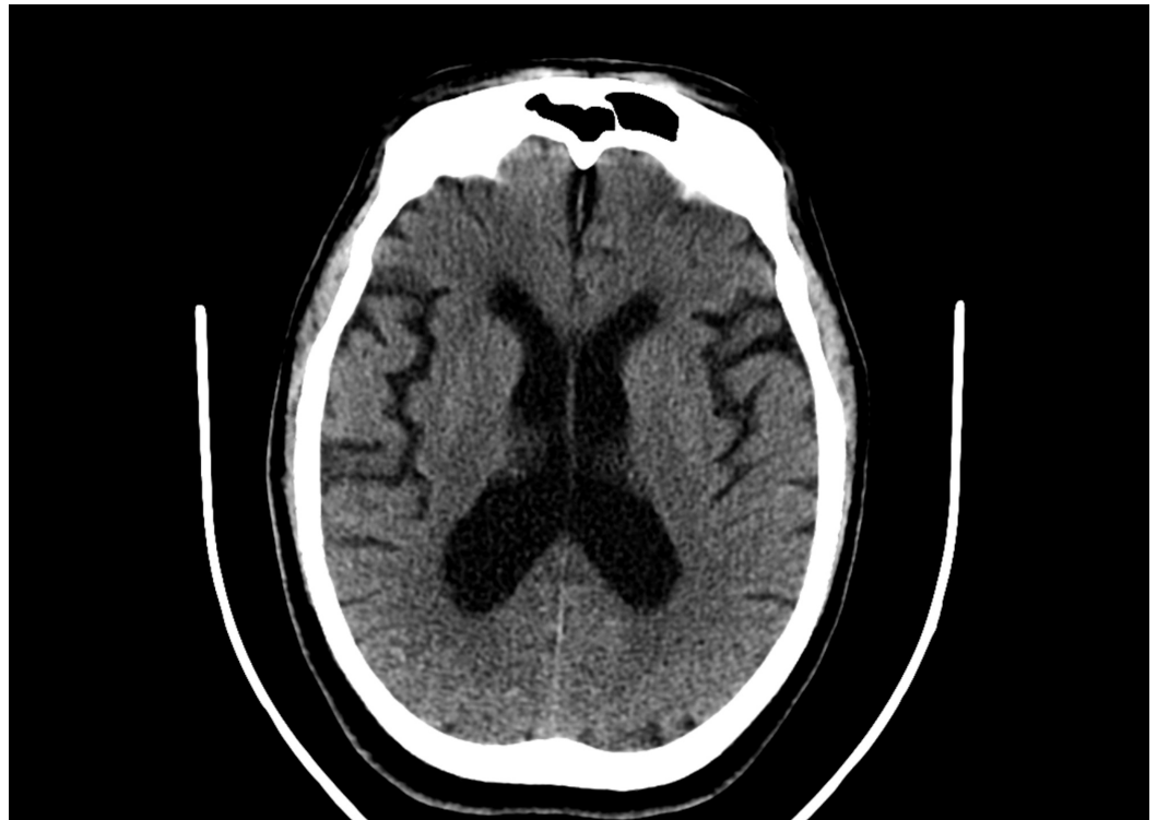
FIGURE 3: Computed Tomography of the Brain Without Contrast (axial view)

Leftwards facing red arrow shows the emphysematous changes.