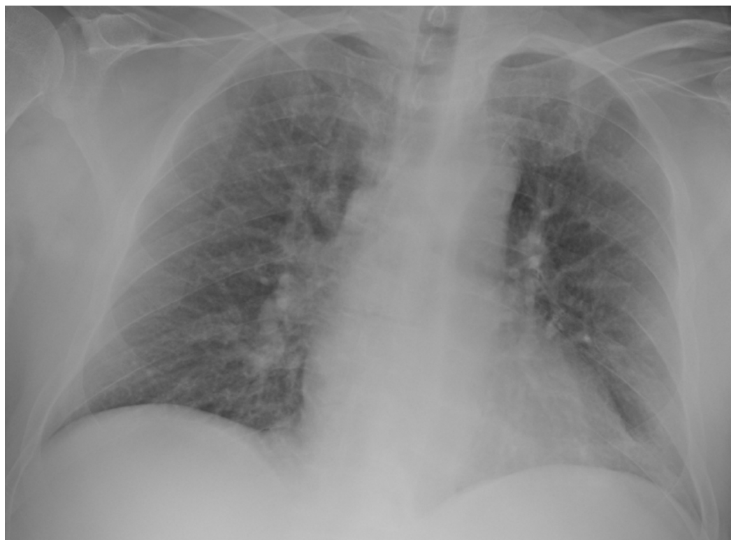
FIGURE 1: X-ray of the Chest (coronal view)